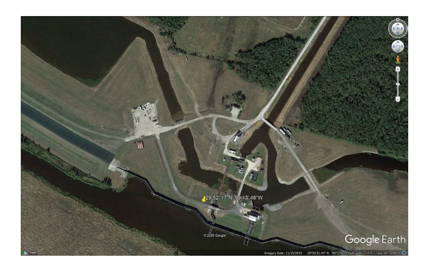
Figure 2: Aerial View